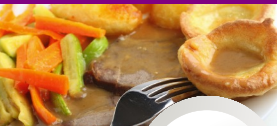
Pork and apple casserole with rice